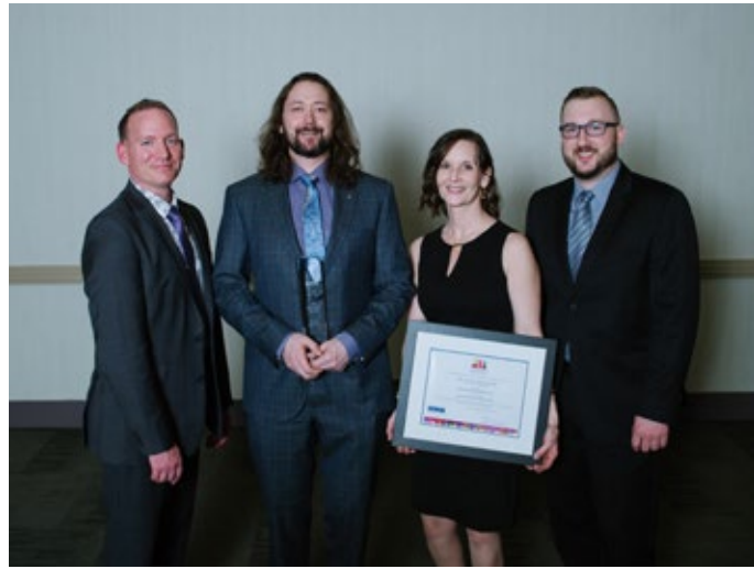
TOBY Retail Building – Park Place Shopping Centre (Lethbridge), Primaris Management.