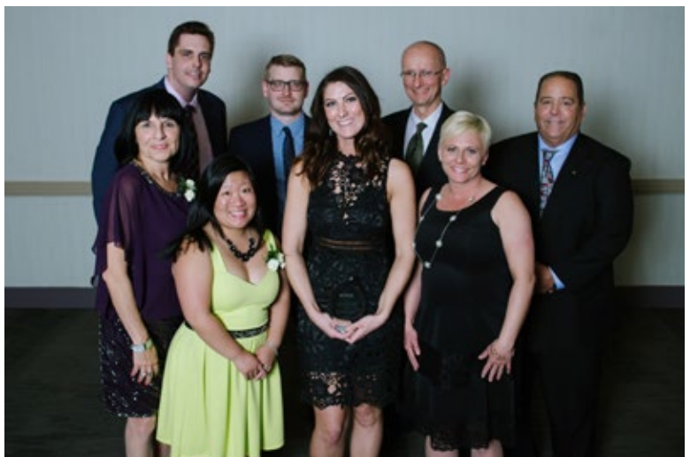
The Property Management Team of the Year award recognizes the people who make a difference every day, going above and beyond to ensure their tenants and the public have access to well-maintained spaces. The winner was Suncor Energy Centre, Brookfield Property Partners .