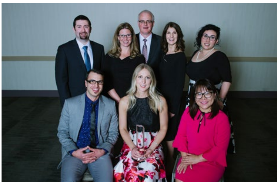
TOBY 500,000 – 1M. sq/ft – Livingstone Place, QuadReal Property Group.