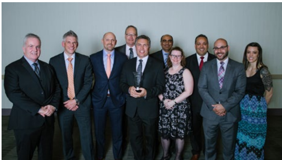
The Pinnacle Award for Customer Service recognizes and promotes service excellence in the commercial real estate industry. This year's recipient was GDI Integrated Facility Services for their industry-leading approach to customer service .