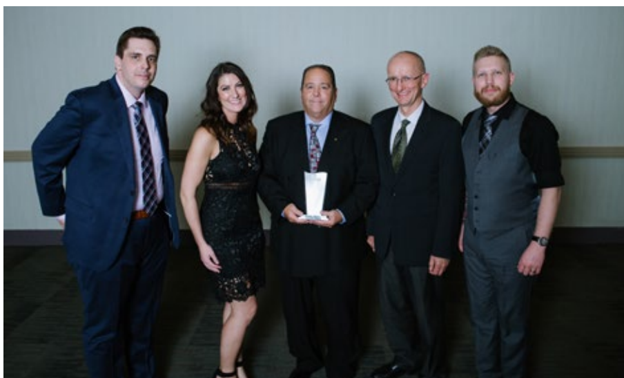
The Building Operations Team of the Year award acknowledges that it takes a team of dedicated operators to effectively run a building, and looks at all aspects of operations including tenant services, emergency preparedness, workplace safety, energy and waste management. The recipient was Suncor Energy Centre, Brookfield Property Partners .