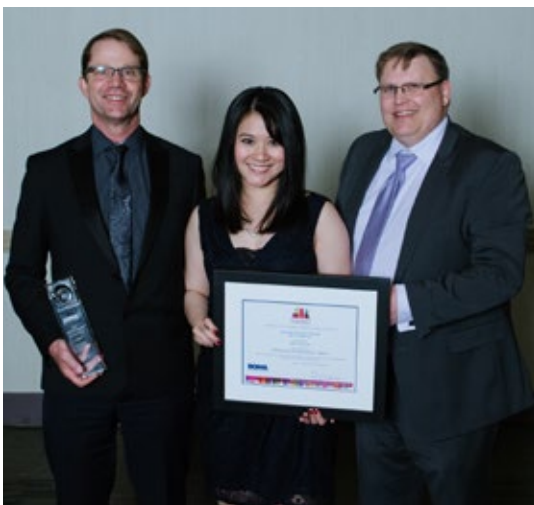
Earth Award in the Universal Category – Calgary Courts Centre, Alberta Infrastructure, managed by SNC-Lavalin.

The Earth Award is perhaps the most rigorous of the award standards, and recognizes buildings that excel in environmentally-sound management and resource preservation, and includes occupational health and safety criteria. The category winners were: