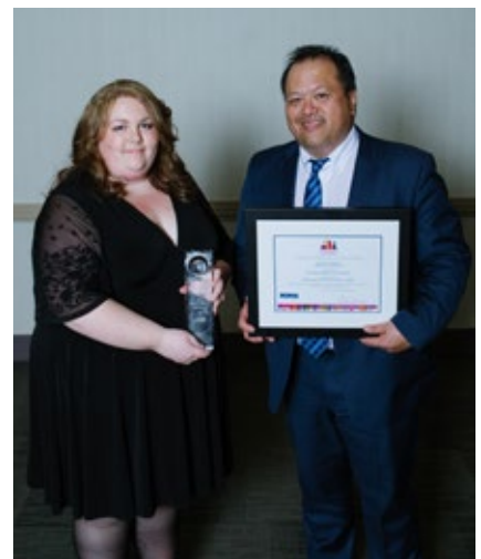
Earth Award in the Retail Category – Seton Gateway, FCR Management Services LP.