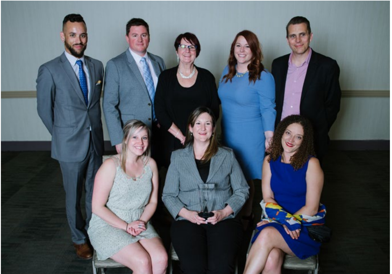
The Pinnacle Award for Above and Beyond recognizes those who provided a service to a customer that was unexpected, extraordinary, surprising, caring and perhaps even entertaining and outrageous at times. This year's award went to ServiceMaster of Calgary for their flood restoration work on Sainte Marguerite Bourgeoys School .

The Earth Award is perhaps the most rigorous of the award standards, and recognizes buildings that excel in environmentally-sound management and resource preservation, and includes occupational health and safety criteria. The category winners were: