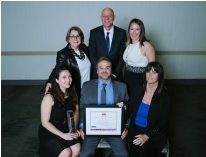
TOBY 100,000 – 249,999 sq/ft – 999 8th Street, Triovest Realty Advisors.