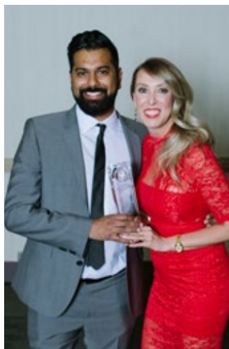
Earth Award in the Office Category – Eighth Avenue Place, Hines Canada.