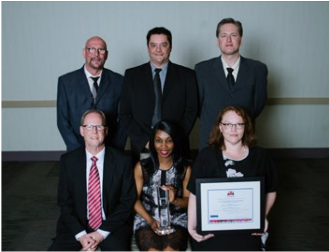
TOBY Medical Building – Cochrane Community Health Centre, Bentall Kennedy.

The Outstanding Building of the Year (TOBY) Awards looks at all facets of a building's operation, and recognizes quality in commercial real estate buildings while rewarding excellence in building management. The category winners were: